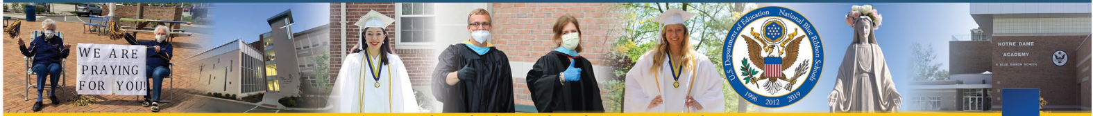
An e-Newsletter for the Families of Notre Dame Academy